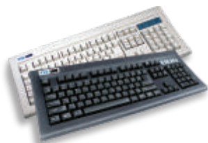
TVS Gold Keyboards

TVS-E customized a solution especially for MK Ahmed Supermarket to address all their pain points. The solution included an ATOM processor based Modular POS system with Thermal Printers (RP-3150 that can print over 48 bills per minute), Omni-directional Scanners (BSL-301 Gold with a scan speed of over 1,400 scans per second), TVS-E Mouse & Gold keyboard (the most selling keyboard of India), a 15" TFT screen (for wide viewing and transparent operations), Customer Displays (PD-220 VFD to display the current discount offers) and other peripherals like cash drawers for security. With this complete range of products and comprehensive service offering – ALL UNDER ONE ROOF, TVS-E became the 'one stop solution' provider to MK Ahmed Supermarket.